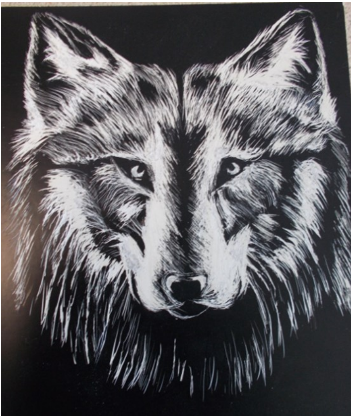
Examples of Lower Sixth students' work in scraper board etching are shown (clockwise, from top): Ed Garetta, Amelia Rudd, Chloe Lidington and Olivia Broome