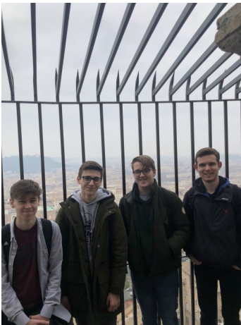
Students get a bird's eye view of Rome from the Basilica